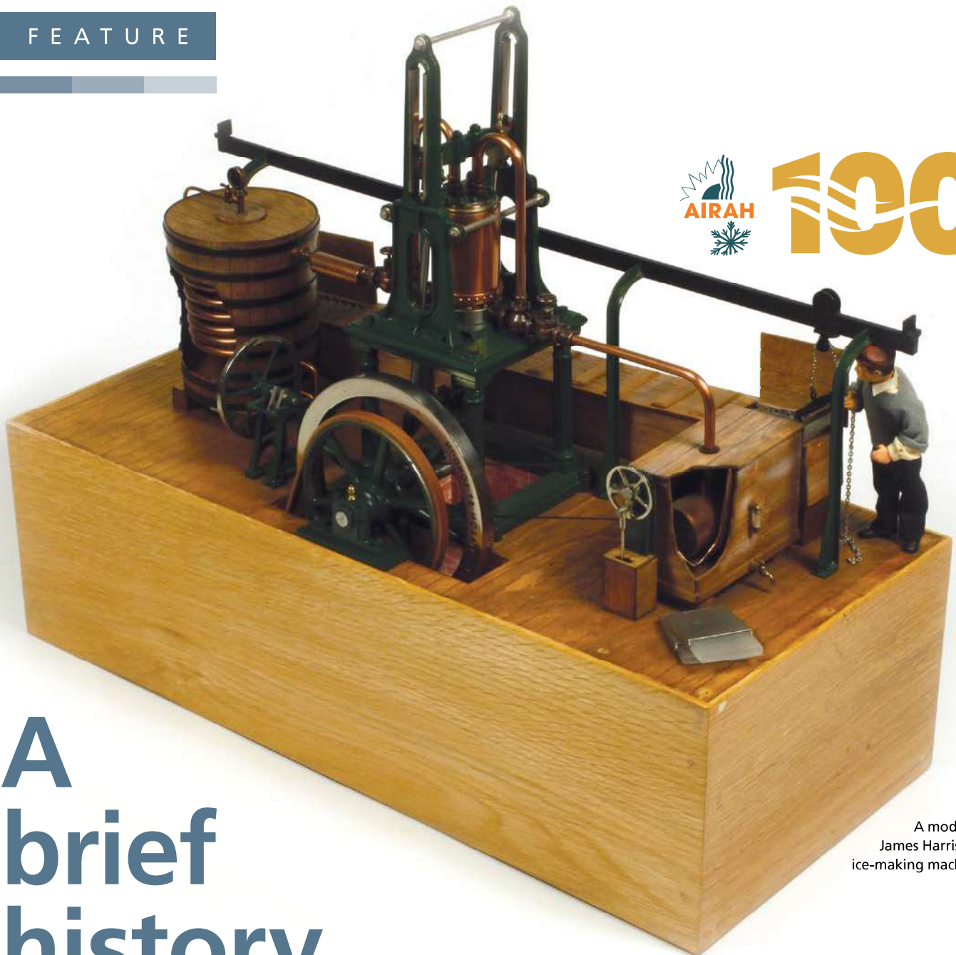
A model of James Harrison's ice-making machine.